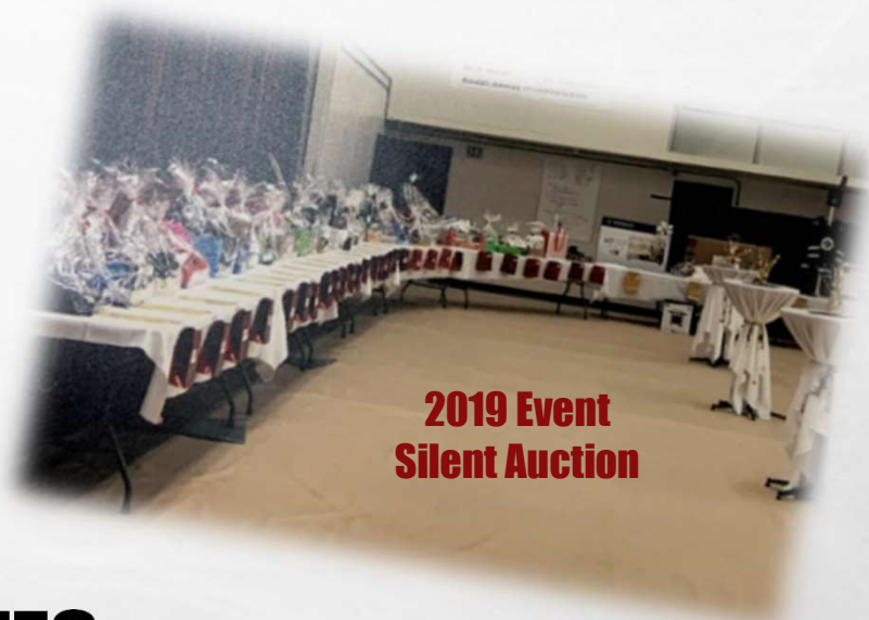
2019 Event Silent Auction